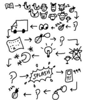
What The Ladybird Heard

Working on phase 4 in our phonic sessions, we have practised reading and spelling words with letter blends "consonant clusters" at the start of a word st tr dr gr cr br fr bl fl gl pl cl sl sp tw sm pr sc sk sn. These are not new sounds, but single sounds that are blended closely together. Clusters are easier to read, but more challenging to write because we need to listen carefully when robot talking.